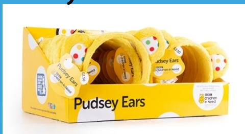
Pudsey Ears £2.50