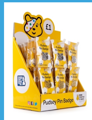
Pudsey pin badge £1