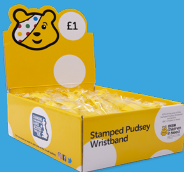
Pudsey wristband £1