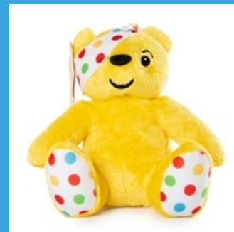
Pudsey plush toy £5