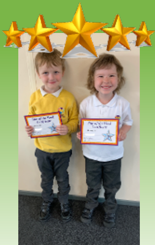
Stars of the Week!