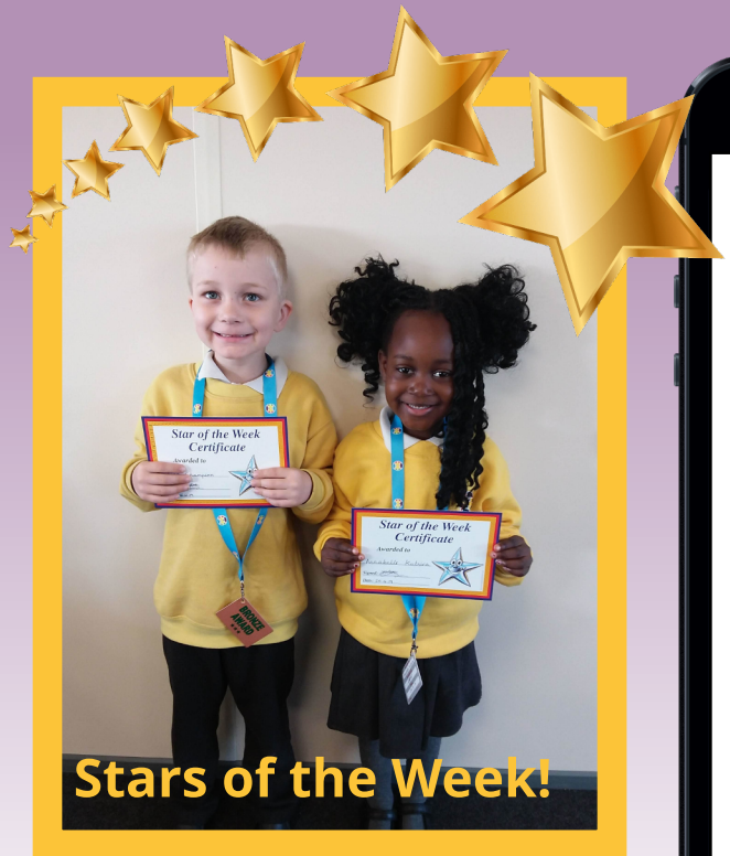
Stars of the Week!